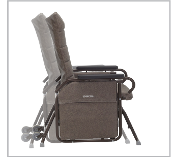
Gentle gliding motion