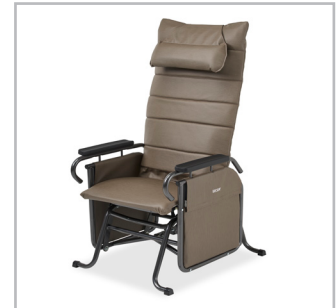
Auto-locking feature increases safety and prevents falls